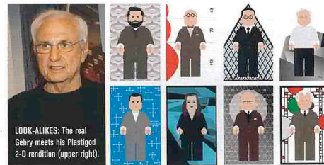
LOOK-ALIKES: The real Gehry meets his Plastigod 2-D rendition (upper right).

Forget Home Depot. Now you can stop by the beauty counter for some gardening needs. Just in time for Earth Day on April 22, gloss authority Cargo has introduced its eco-friendly PlantLove botanical lipstick ($20), which also doubles as a seed packet. The paper box is inlaid with wildflower seeds, so just toss it in some Miracle-Gro and wait for your bouquet to sprout. Even better, the tube is made entirely of biodegradable corn (yes, corn). Stock up on all five celeb-designed shades—from Lindsay Lohan's pretty pink to Evangeline Lilly's sheer coral—to create your own centerpieces. Visit www.sephora.com . —Wendy Wong